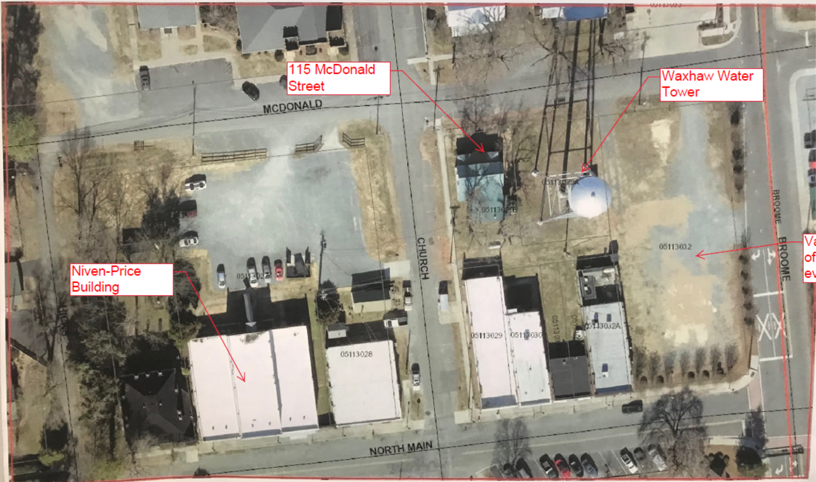
Appendix 4. Core Parcels Existing Conditions: Aerial photo showing existing conditions of the 4 core parcels within the study area