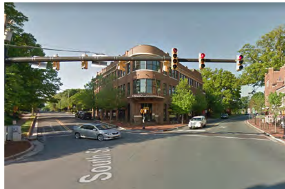
The Flatiron Building, Davidson, SC