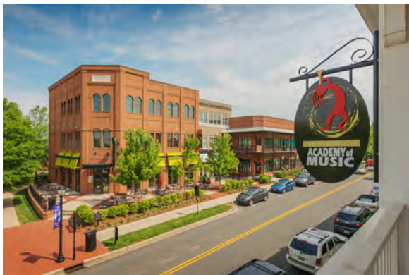
Baxter Village, Fort Mill, SC