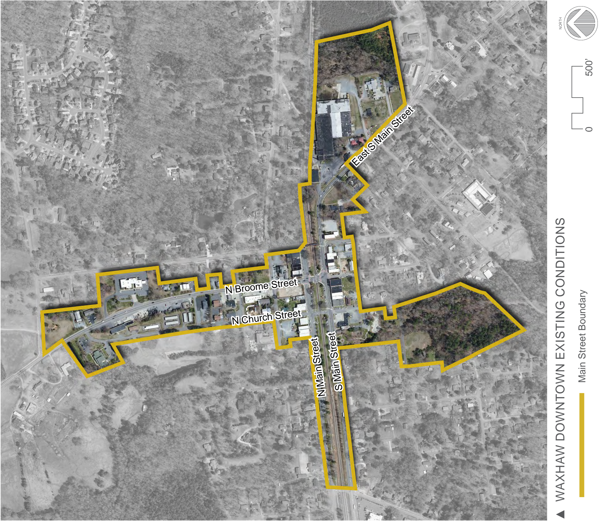
▲ WAXHAW DOWNTOWN EXISTING CONDITIONS