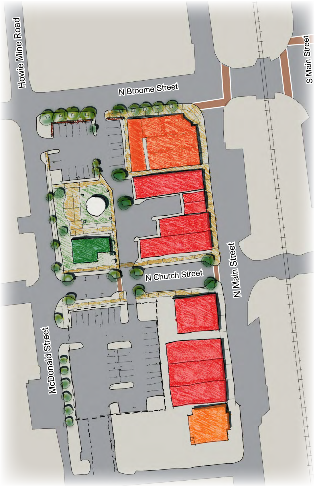
▲ WAXHAW DOWNTOWN - NORTH MAIN STREET