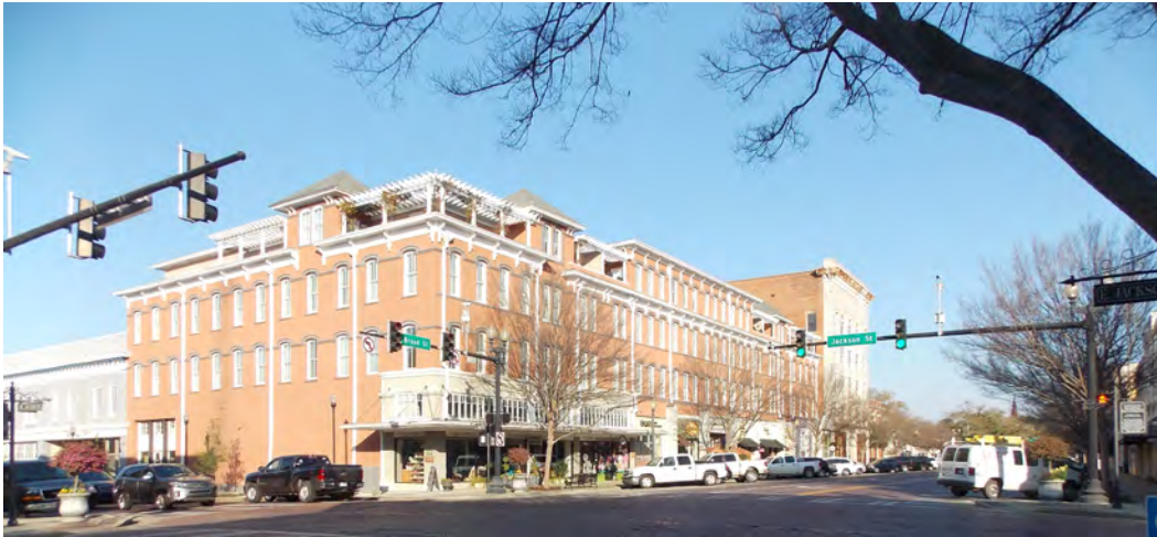
The Grove Arcade in Asheville, NC